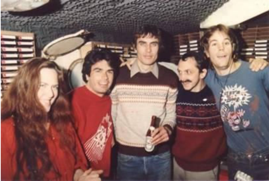
June 1984

And it really was an adventure. I especially remember refitting the ship in Fort. Lauderdale, crossing the Atlantic on the Communicator, the mail buoy, stopping at Sao Miguel and New Ross and being sea-sick for days. The North Sea storms wrecking the antennae, hopping from the ship to the tenders, slipping into the UK before dawn, the harbor master that chased us away, the Panamanians, the news people, Laser road shows, the bomb threat, the night we were drifting in small boat with a dead motor, the wonderful people that visited on weekends because they only wanted to meet us, 13 weeks without getting off, the multinational crew, visiting London, Amsterdam , Dublin, Tunisia, Paris, Kent, Cardiff, a short stint at Radio Nova, hanging out with the Caroline crew, real sailors and the closeness of the Laser 558 DJs . It all took place in less than two years.