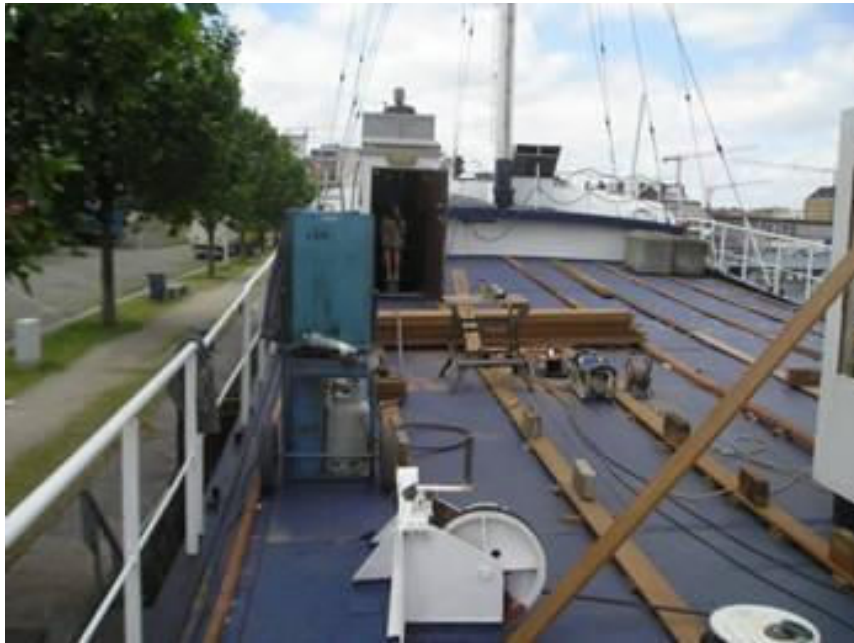
Deck Norderney 2009

Talking about Veronica, the town counsel from The Hague has agreed that research has to be down on plans to bring the former Veronica vessel, Norderney, from Antwerp to the harbour of Scheveningen . Scheveningen is part of the counsel The Hague. Of course the harbour was very important during offshore days as the Dutch stations were mostly tendered from Scheveningen. Also the fact that Veronica was responsible for the success of the Dutch Beat Groups from The Hague must be a reason to bring the ship to Scheveningen. So let's wait what will happen next.