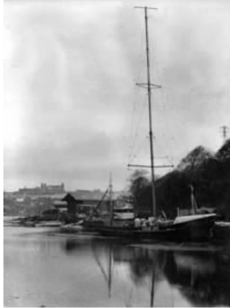
Radio 270 vessel in Whitby harbour.