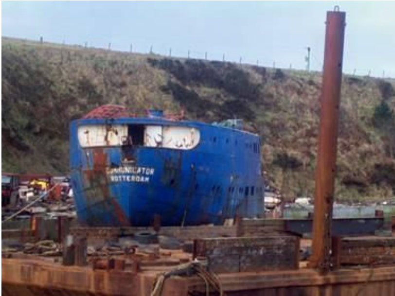
MV Communicator 2009