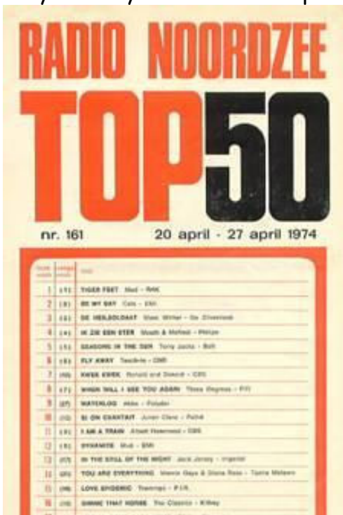
Example of a Radio Noordzee Top 50