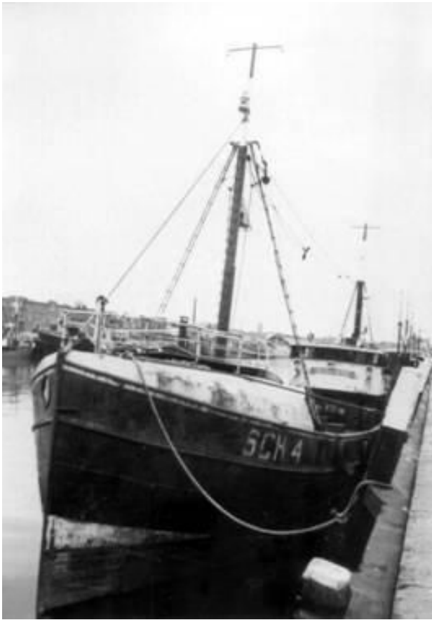
MV Elisabeth