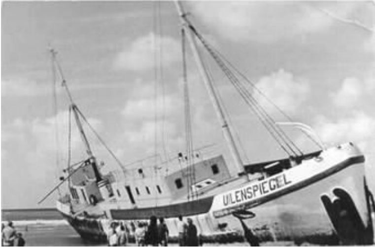
MV Uilenspiegel on beach near Retranchement

VRT Canvas Documentary, please feel free to ask for it on: hermie4@telenet.be