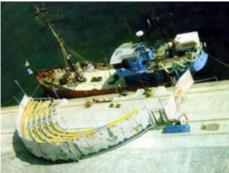
MV Elisabeth nowadays in Amsterdam harbour