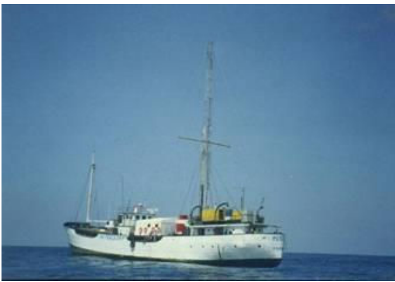
Voice of Peace off Tel Aviv coast.