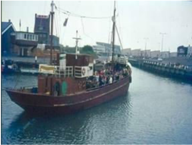
Morgenstern leaving Scheveningen harbour.

Well Mark thanks for the video on you tube as well your story on visiting Scheveningen harbour recently. I can tell you none of the Trips vessels is the Morgenstern. This vessel was used as one of the vessels from Radio Delmare in the late seventies of last century and of course we have a photo for you.