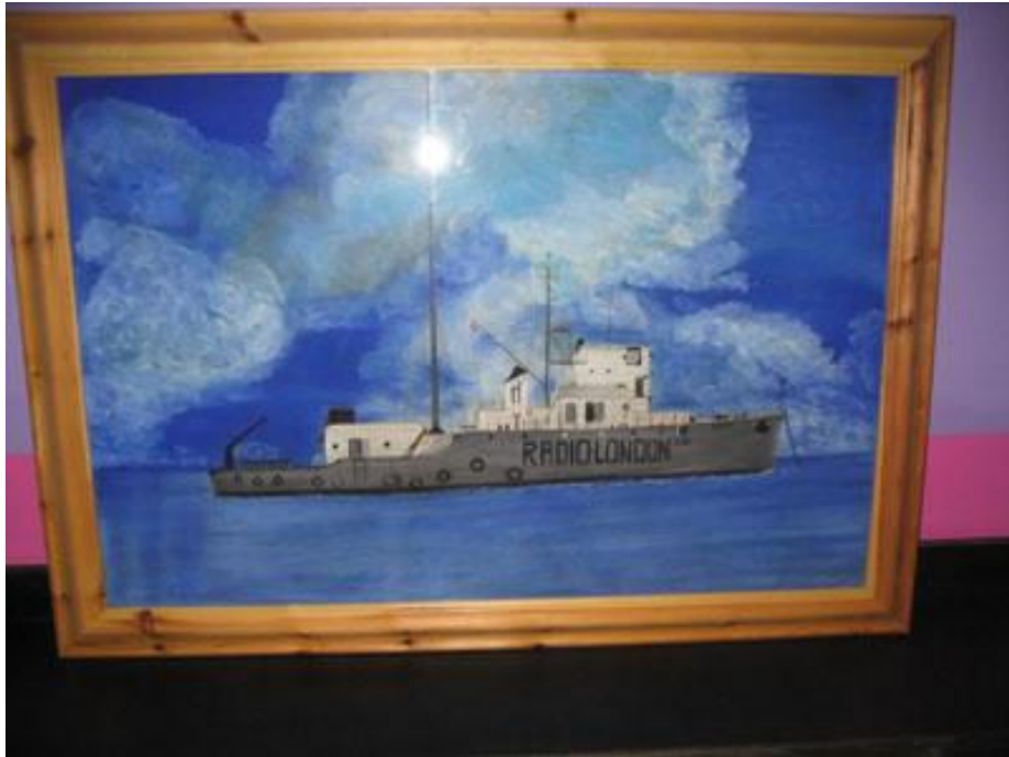
MV Galaxy.