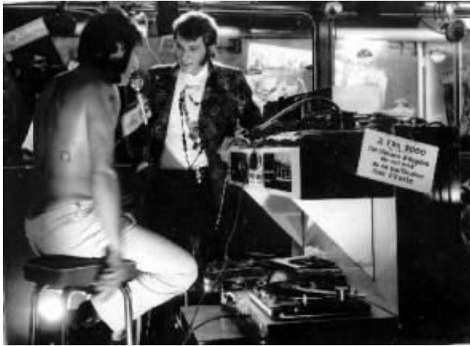
The Emperor Rosko and The Great Johnny Hallyday