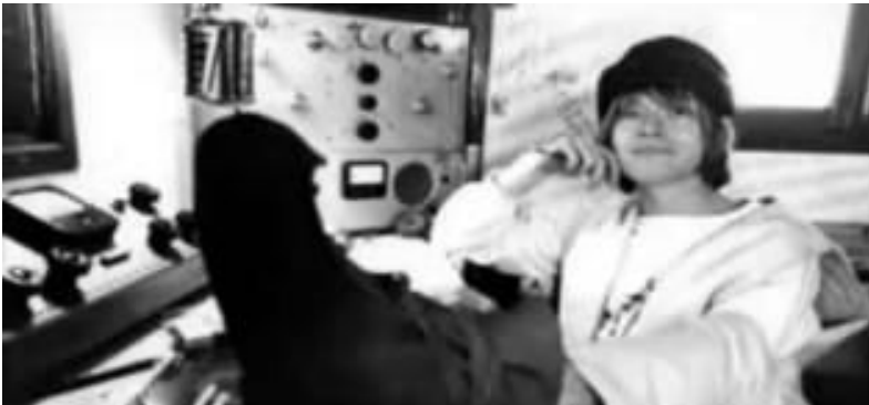
Another Stone on board Radio Syd, Brian Jones