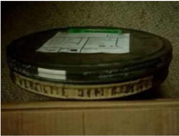
Movie tin once used for opening hour RTV Noordzee.