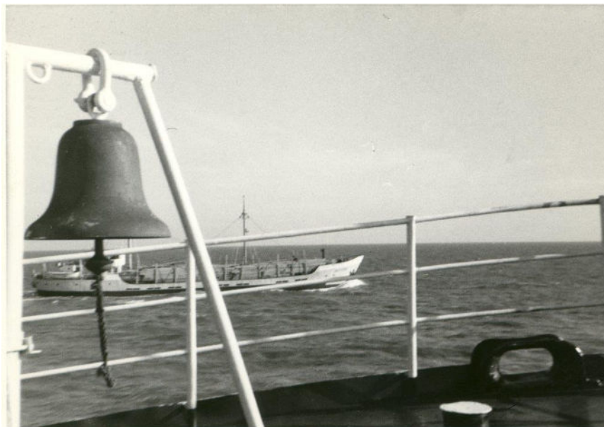
Bell of the Laissez Faire