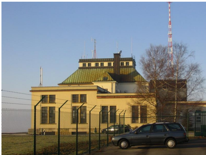
Junglister