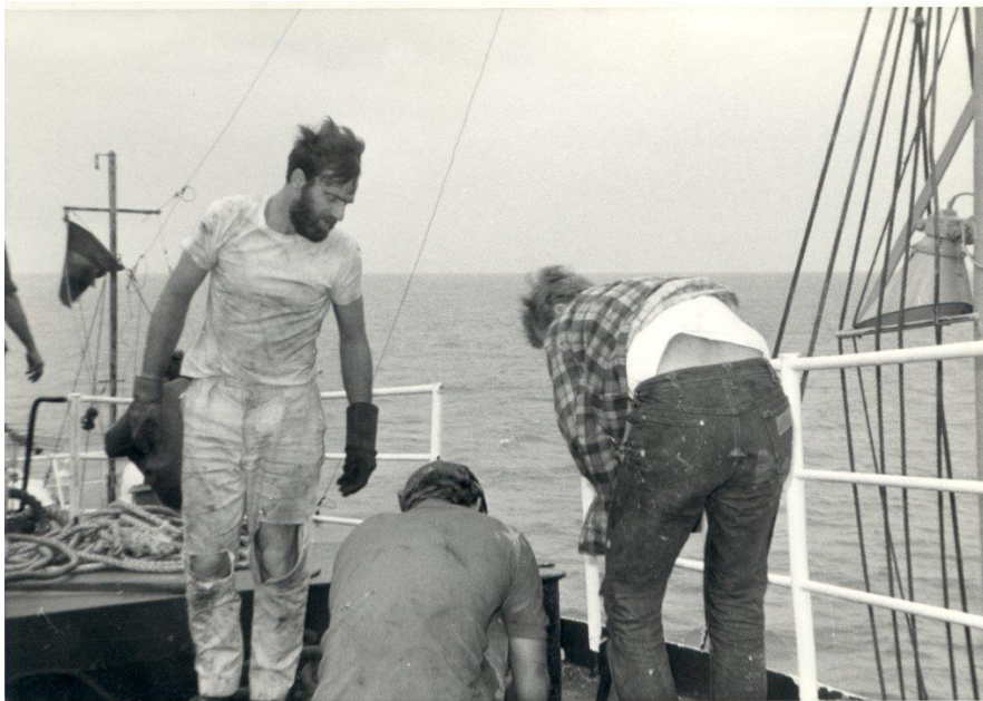
Crew working on the anchor chain