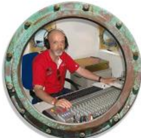
Kord Photo: Mi Amigo International

http://tx.mb21.co.uk/gallery/gallerypage.php?txid=1654&pageid=336 0