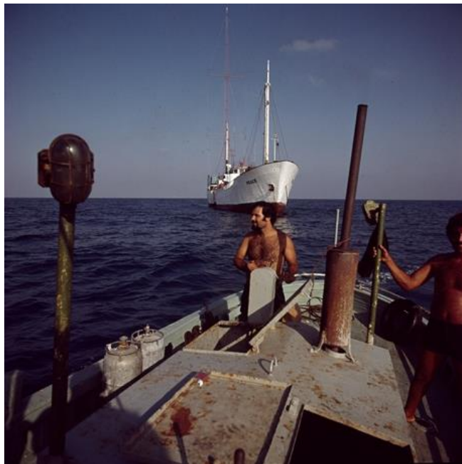
Peace Ship and tender in 1976