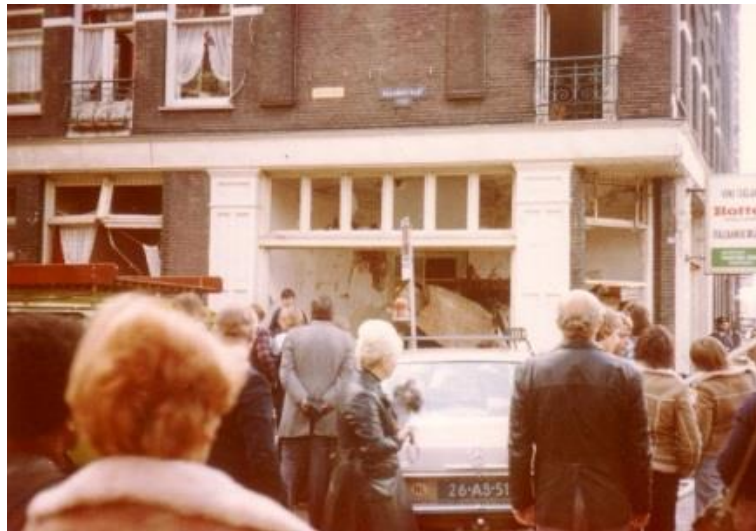
Italian shop after the explosion.