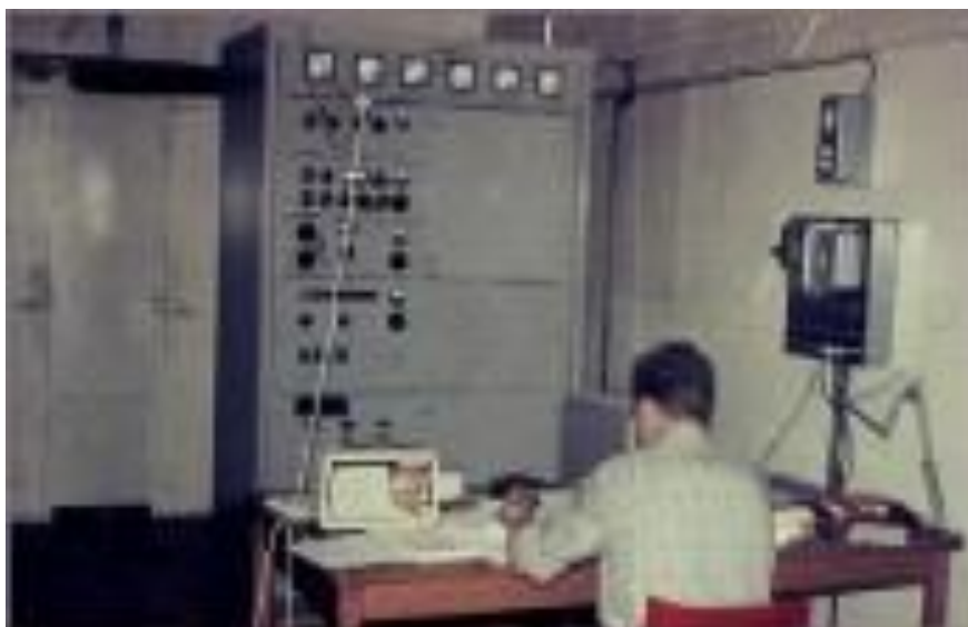
Siemens transmitter on Lucky Star