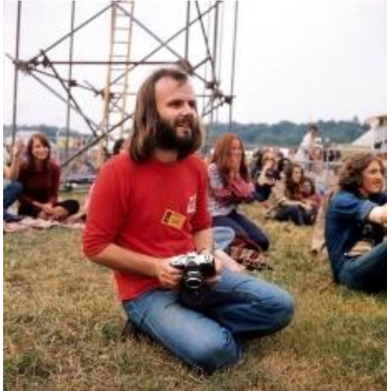
John Peel 1968