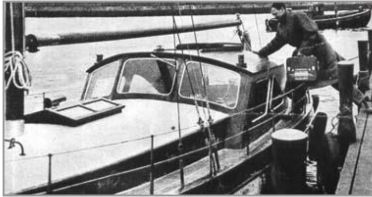
One of Mercur little tenders