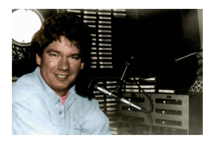
KC on Laser 576

In Britain the climate is in some ways similar to the CA central coast, so they are able to grow celery and Brussels sprouts, but they aren't as good as in CA. In fact, in London I saw 'Bud of CA' lettuce. Beer, my God, did they bring on a lot. The crew has consumed amazing amounts in just a few days. Johnny, one of the crew members, went back with the 'Lady Gwen'. I gave it serious consideration, but stayed.