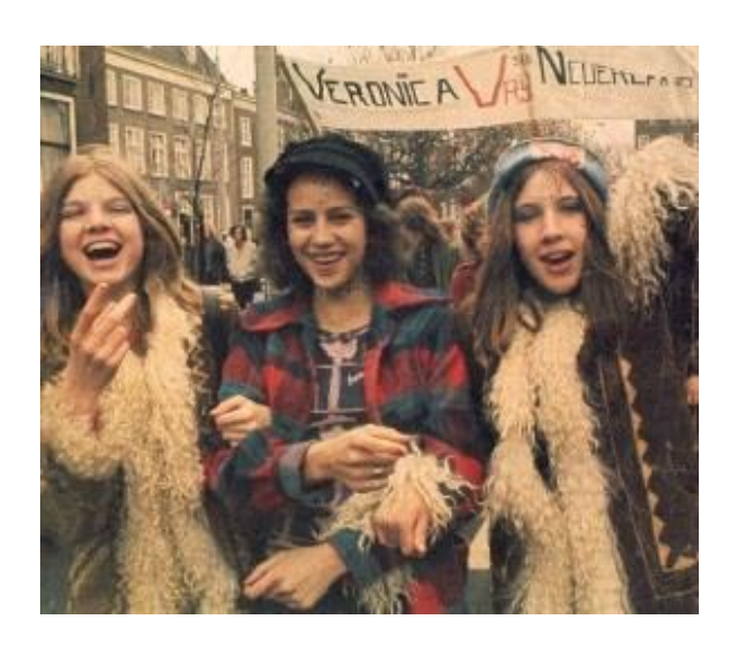
18 april 1973.

For me, one of the most fascinating aspects was the simulcasting from the Mi Amigo and the Norderney (which had been refloated that day - I remember it quite well.) The shows I've heard so far were live from both ships. Brief mentions were made of the disaster of 2nd April 1973 and what had been happening over the following 16 days. The one I heard from the Mi Amigo had no ads (possibly the equipment not being geared up to play Veronica ads?) I remember at least 24 hours of separate programs from each ship and a linkup, but I can't remember which came first!