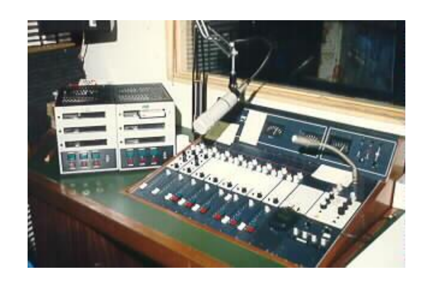
Studio Laser Hot Hits

At last, Saturday night, Sunday morning about 2am the 'Lady Gwen', the boat I came to hell on, arrived with food and even some fresh milk. Also tons of meat, mostly red meat, yeah! I can't believe I'm at sea for two weeks and I've not had any fish. In general British food 'sucks', but at least this is something!