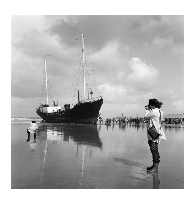
Norderney on the beach.

Special leaflets and magazines about offshore radio