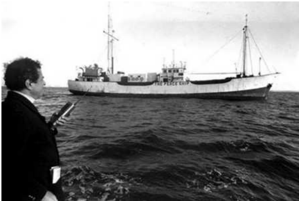
Abie Nathan near the Peace ship.

Well Svenn thanks a lot for sending this newsflash from Norway!