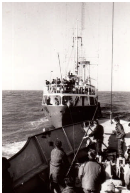
MEBO II on tow to England.

Many thanks for the latest Report; it's the longest one I can remember; it took me about one-and-a-quarter hours to read through, courtesy of the 'Guide' speech-reader. The most interesting aspect for me in the current Report was part three in the feature on Carl Mitchell. I feel that the first nine months of RNI were arguably the most momentous of the whole offshore period. I was in hospital during the test transmissions and tuned in whenever I could and would occasionally fall asleep with the radio on - nothing's changed in that respect! What excited me initially was that, particularly on hearing Roger Day on some of the later tests, it sounded like a direct follow-on from Caroline and later in the year I felt that this was probably how Caroline would have evolved. What I remember most about Carl Mitchell is listening to him on the night when the 'MEBO' crossed the North Sea. The following day I was discharged from hospital and was eager to get back home to Southend on Sea, where I could hear RNI loud and clear, with the volume knob at the lowest position! The first full record I heard was, appropriately, 'Catch Us If You Can' by the Dave Clark 5.