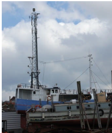
MV FIREWALL