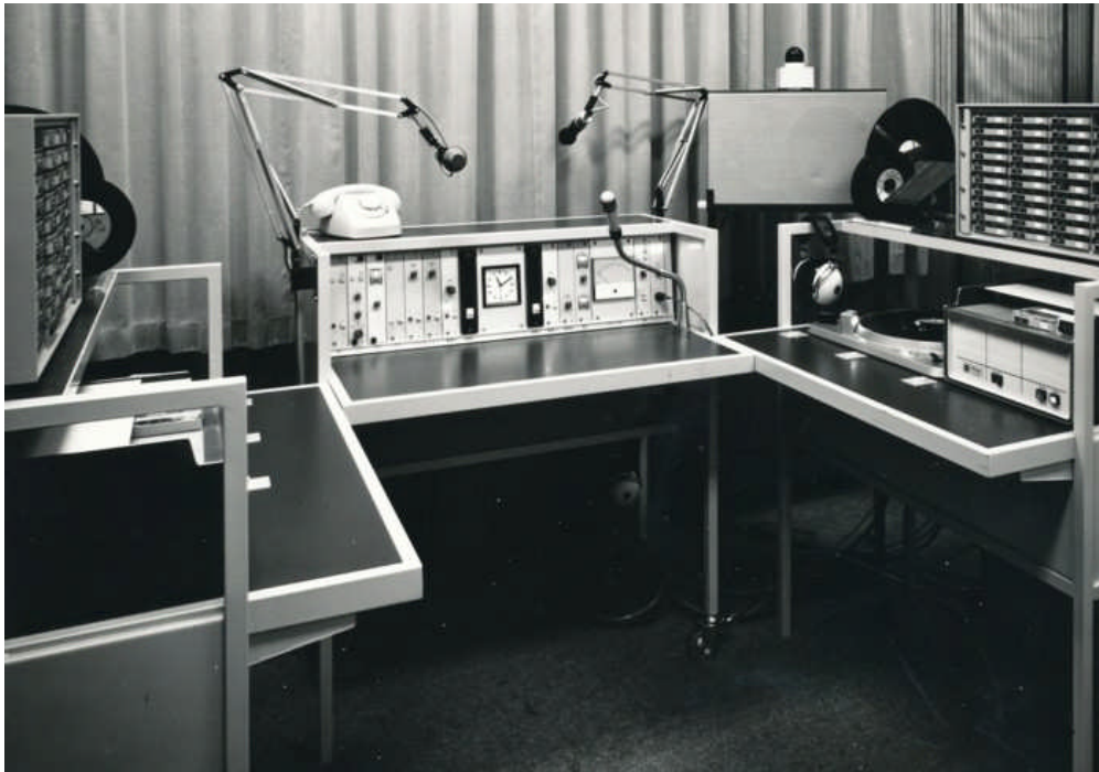
DEEJAY TABLE HILVERSUM 3 PHOTO COLLECTION PAUL SNOEK

In my archive I've a photo which shows that deejay table directly after the technical department of the NOS had installed it. Fresh, clean as well as compact. The photo is from the Paul Snoek collection. If you have also a photograph of a studio without presenter don't hesitate to send it to HKnot@home.nl