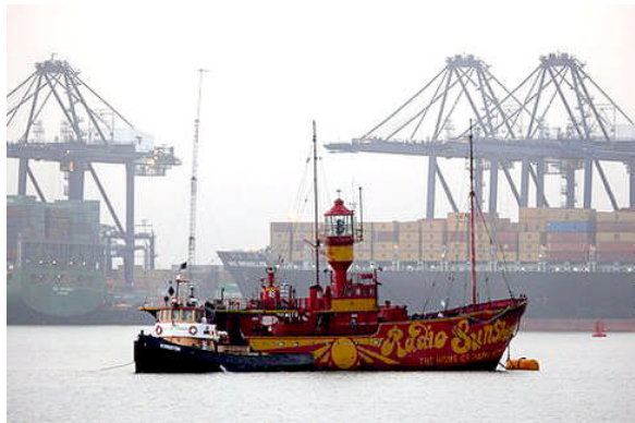
LV18 Harwich Harbour March 2009

http://www.harwichandmanningtreestandard.co.uk/news/localnews/5027756 .Harwich Historic lightship plans in doubt/