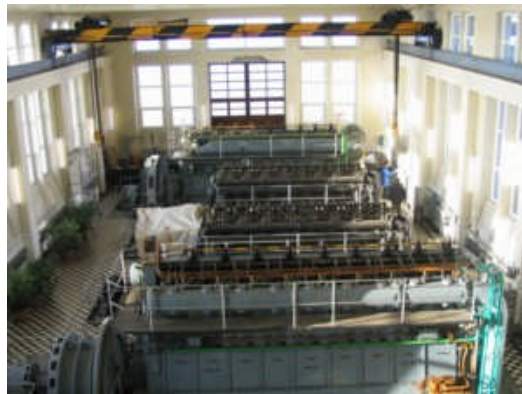
View at the generator room Radio Luxembourg