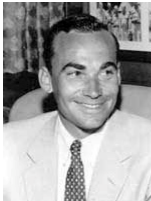
TODD STORZ

This is not a Facebook "Fan" page which makes it even more interesting. The Todd Storz Facebook page is being presented as a person, albeit dead one. I